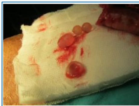
Fig. 2: Hydatid cyst

Liver is the first filter and most common site for hydatid disease. (3) Some may reach the lung, second filter and into systemic circulation causing hydatid disease in peritoneal cavity, spleen, breast, soft tissues and other parts. (4) Other mode of dissemination is through lymphatics. Secondary bacterial infection can lead to abscess formation. Liver hydatid can get infected by ascending infection via bile duct or portal vein. Rarely can it regress spontaneously. In the natural course of healing calcification can occur. Our aim is to review various atypical presentations of hydatid disease and their management in our Institute, RIMS, Kadapa, A. P.