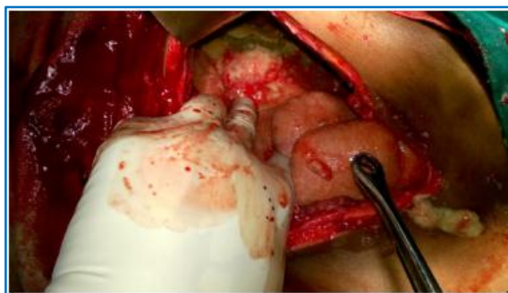
Fig. 4: Hydatid cyst in omentum