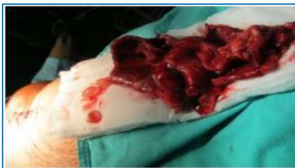
Fig. 3: Cystectomy in Hydatid liver

MATERIALS AND METHODS: A retrospective study was done on 21 patients of hydatid disease who were managed successfully at RIMS kadapa from 2012. Of these patients 12 were males and 09 were females. Patients' age ranged from 32 to 65 years. Liver was involved in 12 cases, spleen in 3 cases. Omentum in 03 cases, peritoneal cavity in 02 cases, breast in 01 case and soft tissue in axilla was involved in 01 case. Diagnosis depends on history, clinical examination, biochemical investigations, Serology and pathological diagnosis. Radiological investigations involve ultra sound, CT, and MRI. Sonography is the most sensitive technique for detection of membranous septae and hydatid sand within the cyst. CT is best to show the calcification, cyst infection and peritoneal seedings. MRI shows low signal intensity rim of the hydatid cyst (5) . FNAC is also a useful diagnostic method as it does not cause any complication. It has been reported to be useful sometimes when serology is negative (6) . Diagnosis is difficult when disease is present at unusual location (atypical site) (7) . Surgery with complete removal of cyst is the main stay of treatment with high success rate. Chemotherapy with albendazole has also been used with some success to sterilize the cyst. Symptoms of the disease vary according to the localization of the cyst (Table 1).