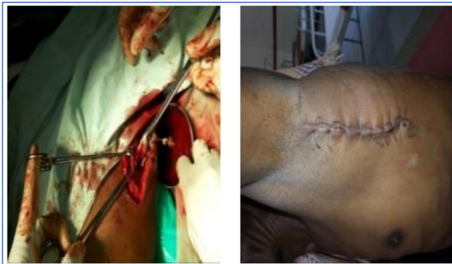
Fig. 7: Hydatid cyst in axila